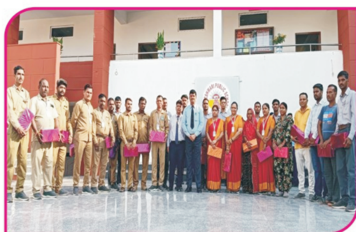
Honoring Hands that Build the Nation.