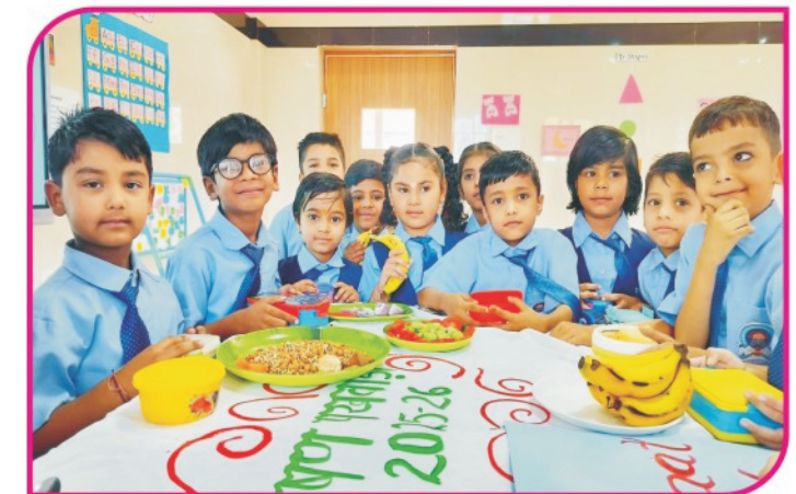
"Protect Our Planet, Preserve Our Future"